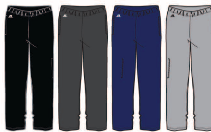
BLK Black GW8 Black Heather QZB Navy OXF Oxford