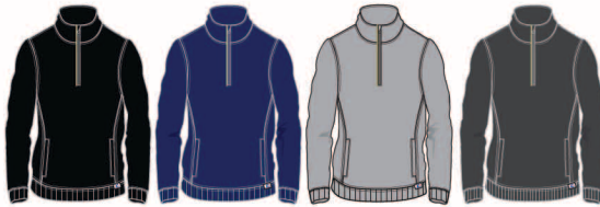
BLK Black QZB Navy OXF Oxford GW8 Black Heather