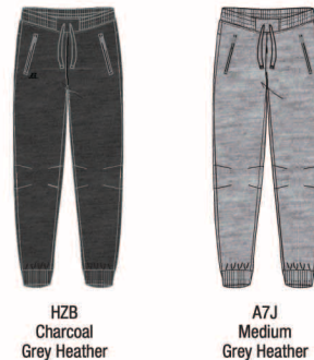
HZB Charcoal Grey Heather