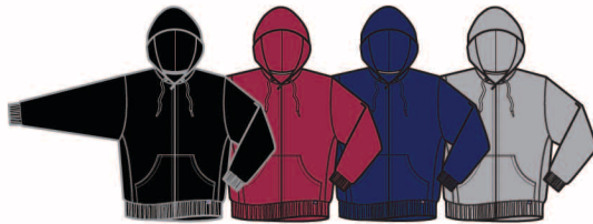
BLK Black CRD Cardinal QZB Navy OXF Oxford