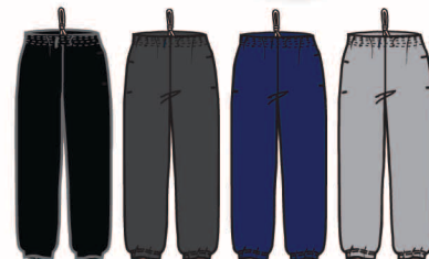
BLK Black GW8 Black Heather QZB Navy *OXF Oxford