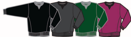
BLK Black GW8 Black Heather DGR Dark Green MAR Maroon