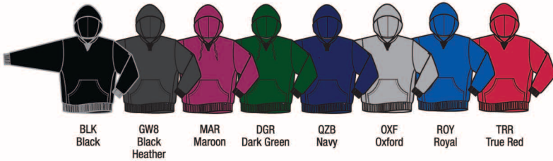
BLK Black GW8 Black Heather MAR Maroon DGR Dark Green QZB Navy OXF Oxford ROY Royal TRR True Red