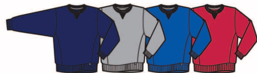
QZB Navy OXF Oxford ROY Royal TRR True Red